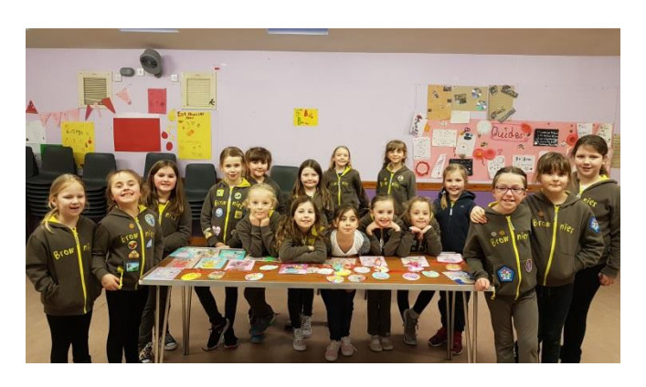
6<sup>th</sup> Buckie Brownies

The girls have had a fun filled year working on Roundabouts, Wow Women Challenge Badge and World Centre Challenge Badge. We had a trip on the Santa Train, scavenger hunts, parties, sand art pictures, food tastings and so much more.