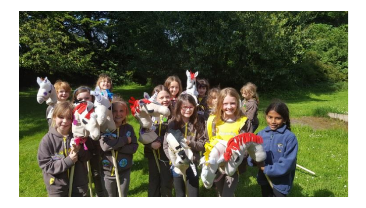
2<sup>nd</sup> Forres Brownies

We enjoyed a talk by the Spey Bay Dolphin Centre on the effects of litter on our marine life and finished the evening collecting litter on the beach.