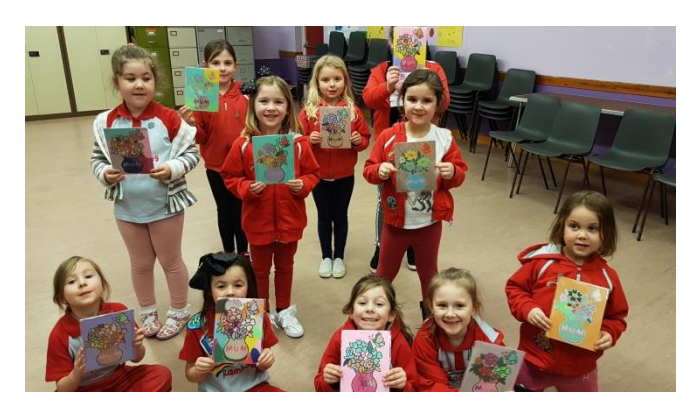
4<sup>th</sup> Buckie Rainbows

A sleepover at The Sealife Centre, Loch Lomond along with Buckie and Cullen Brownies was a real hit. We ended the year with a picnic and games with the Rainbows.