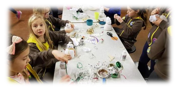
4<sup>th</sup> Lossiemouth Guides

The 2<sup>nd</sup> Lossiemouth Brownies have made a variety of crafts this year including bird feeders, sock snowmen, time machines and edible architecture. We entered miniature gardens into Lossiemouth Flower Show and enjoyed our Promise ceremony on top of the sand dunes at Lossiemouth East Beach. We completed several interest badges as a unit; Road Safety, Seasons, Brownie Traditions, Network Stage 2, Innovate Stage 2 as well as the Thinking Day Leadership Badge. We have enjoyed visits by a local cheerleader and Captain Emma from Easyjet as well as from some furry friends; kittens and rabbits. We had a fantastic time at the County Fun Day and on the County pantomime trip too. We said goodbye to LIT Ailsa Morris as she headed South to Aviemore and we will miss Zoe Walker as she goes on maternity leave.