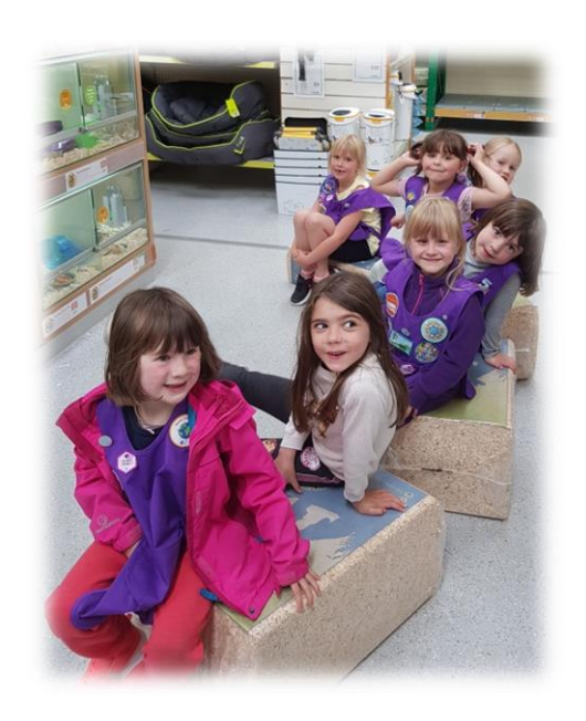
1st Hopeman Guides

This year 1<sup>st</sup> Hopeman Rainbows have started the new programme and have had lots of outdoor activities. We ended the term with a visit to Pets at Home and our annual BBQ with the Hopeman Brownies and Guides.