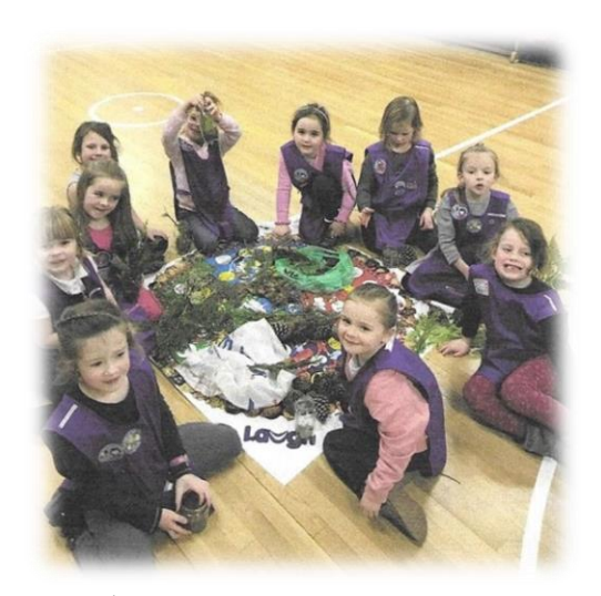
1<sup>st</sup> Burghead Brownies

1<sup>st</sup> Burghead Rainbows have worked hard all year, learning lots of new skills through craft activities. Their main focus has been to earn badges. They most enjoyed carrying out their Innovate Stage 1 badge. Lots of the Rainbows love the new programme and have completed interest badges. They get to show off their hard work at meetings to the other Rainbows.