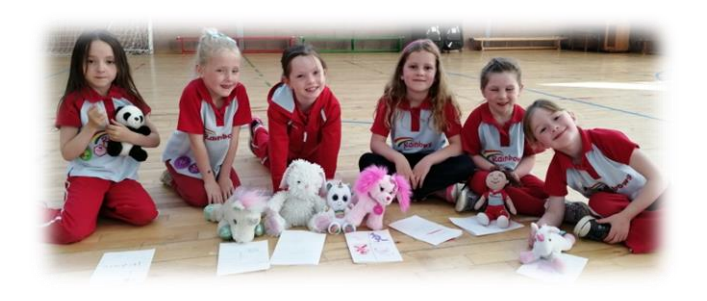
3rd Elgin Rainbows

3<sup>rd</sup> Elgin Rainbows have had a busy year raising money for much needed funds towards the yearly panto trip and for musical instruments. In December, we held a joint raffle with 2<sup>nd</sup> Elgin Brownies and managed to raise £355 between the two groups. We also collaborated on a recipe book with 2nd Elgin Brownies and raised £155. We also did a sponsored walk and raised over £350 when we managed to avoid getting soaked. We started the new programme in September 2018 and found new exciting badges to do and learn.