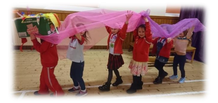
The girls had a fantastic time at the pantomime. We look forward to another fun filled time next year.