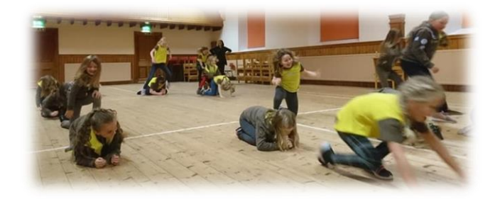
We have enjoyed the year and are looking forward to next year.

We enjoyed our visit to the pantomime. In the spring term we completed the Leap Year badge where we learned many things from old games like leap frog, team games, making puppets and activities about the moon.