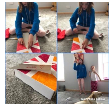
Some of our girls have also completed the Guiding at Hame badge.