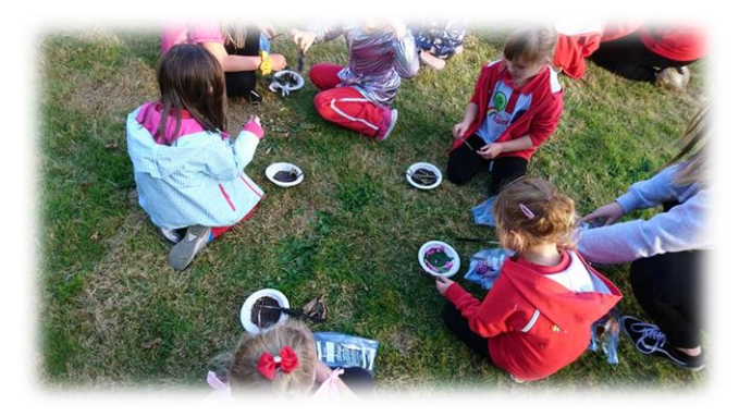
We have enjoyed many parties and celebration including promise ceremonies.

We completed the Feel Good Skills Builder and tried some of the new Unit Meeting Activities.