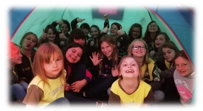
We celebrated Thinking Day and during lockdown we clapped and made noise for the NHS.

We practised pitching a tent and even slept in one (in the hall) during our sleepover. We had a great time doing lots of fun activities.