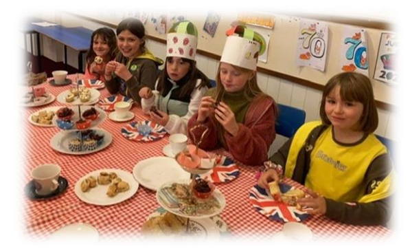
Looking forward to starting back and another year's fun

In June we had a wonderful night celebrating the Queens Platinum Jubileewe made bunting and crowns. We followed with a traditional tea party and an abundance of home bakes and juice served from teapots