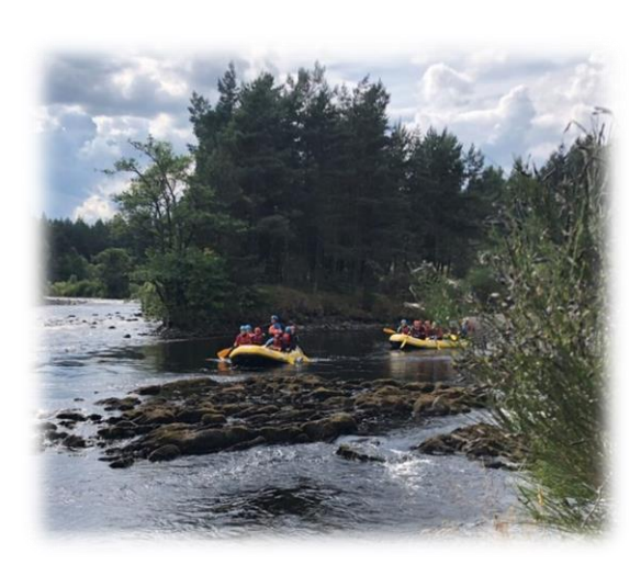
What a great way to see the local area.

We're looking forward to next year's adventures.