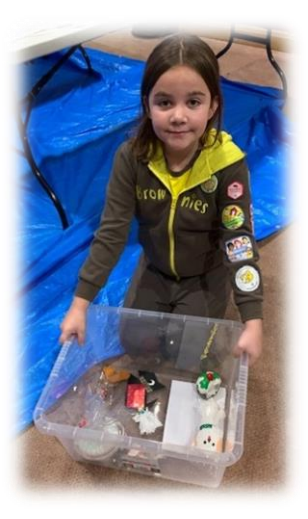
We finished the term with a joint Christmas party.