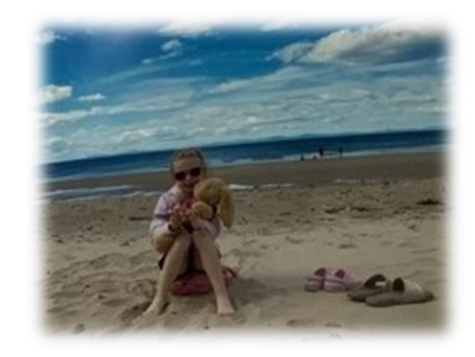
Lola at Hopeman beach

This term we introduced 'Lola'. Lola goes home with one of the girls each week; they also take home her diary and can write about what she's been up to. Lola is loved so much by the girls, and we love hearing what she's been up to each week.